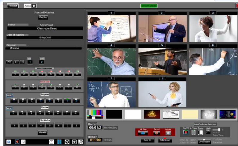
Studio8 Video Images Simulated